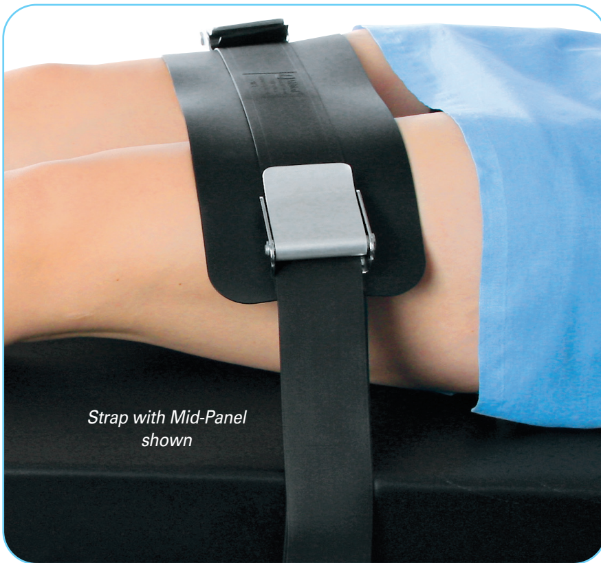
Strap with Mid-Panel shown