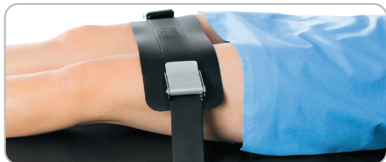
Reduces the risk of cross-contamination