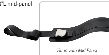
Strap with Mid-Panel