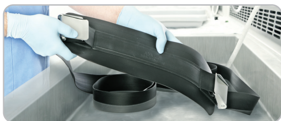
Withstands high-level disinfection