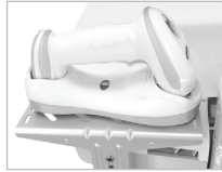
SV SCANNER SHELF 97-780-194