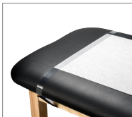
040- Paper Cutter