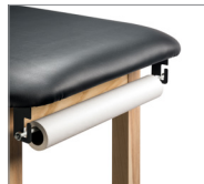
030- Paper Dispenser