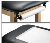
034- Paper Dispenser & Cutter Combo