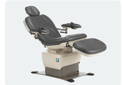
Power Leg Rest 729-001-80