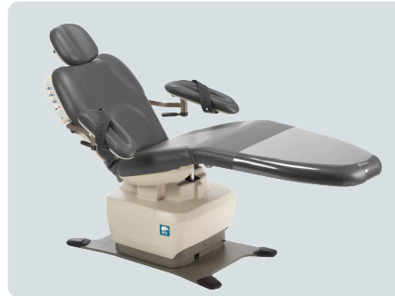
Contour Leg Rest 722-001-80