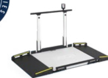
seca XLine Hold (ADA-Compliant)