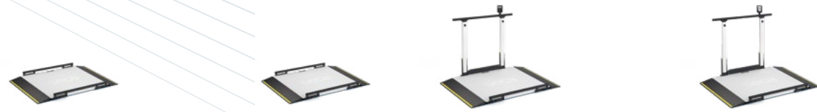
seca XLine Base

Explore the Ideal XLine Model for Your Specific Needs.