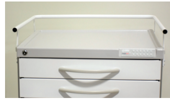
MAYA-GR 3-Sided Guard Rail