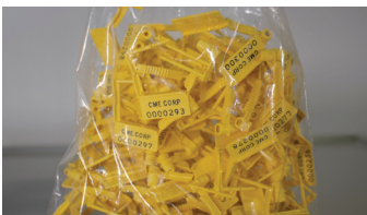
MAYA-BLT Breakaway Lock Seals (Bag of 100)