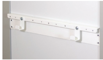
MAYA-UH Utility Hooks **