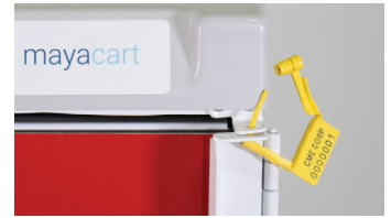
MAYA-BL Breakaway Lock Bar