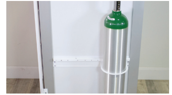
MAYA-02 Oxygen Tank Holder Kit (O 2 Tank Not Included) *