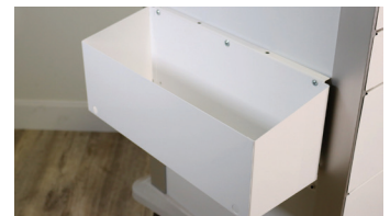
MAYA-BIN Side Storage Bin Medium *