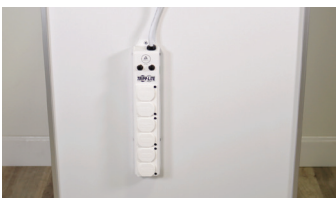
MAYA-PS Medical Grade Power Strip, 6 Outlets, 15 ft. Cord (Cord Wrap Recommended)