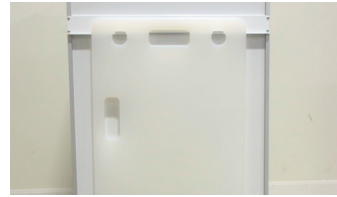
MAYA-CB Cardiac Board