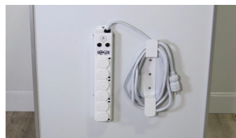
MAYA-CW Cord Wrap