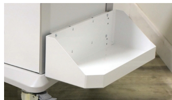
MAYA-SS Suction Shelf *