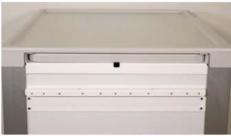
MAYA-SR Side Rail Mount