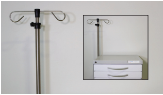
MAYA-IV-POLE IV Pole with Bracket