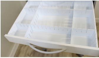
MAYA-3TDSET 3" Tray and Dividers

We have a full line of accessories that work with all of our carts. For additional accessories please visit our website.