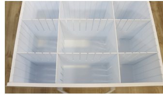
MAYA-9TDSET 9" Tray and Dividers