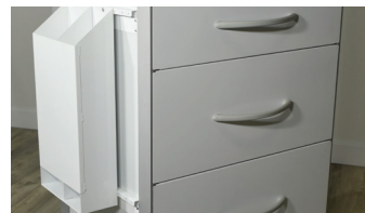
MAYA-CATH Catheter Holder