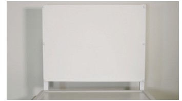
MAYA-BA Backboard with Rear Accessory Rails