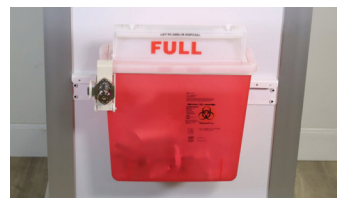
MAYA-SHP 5 Qt. Sharps Container (5 Qt. Locking Bracket Required)