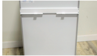
MAYA-CBB Cardiac Board Bracket