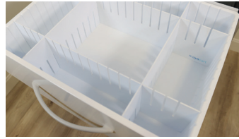
MAYA-6TDSET 6" Tray and Dividers