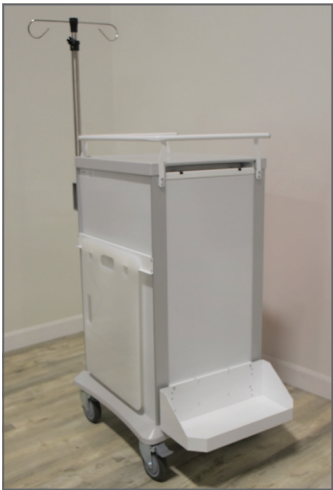
MAYA-CODE-ACCYPACK Optional MayaCode Accessories Package