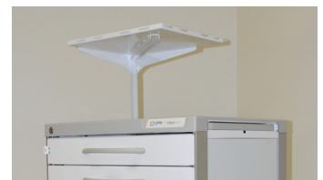
MAYA-DEFIB Defibrillator Shelf

*requires two side rail mounts (MAYA-SR) **requires the side rail mount (MAYA-SR)