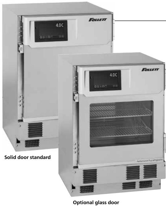
Solid door standard