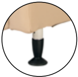
Pedestal Feet or 3” Casters