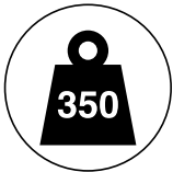
350 lb. Weight Capacity