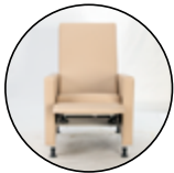
Push Back Recline