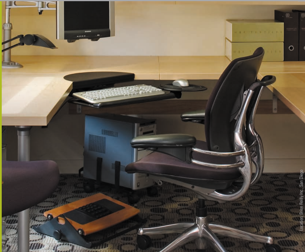
Location: Brian Reilly Inc., San Diego

A highly ergonomic work environment is built around four primary tools—task chair, articulating keyboard/mouse support, adjustable monitor arm and task light—that work together to improve the health and comfort of computer users. The absence of any one of these four tools may impact the ergonomic benefits of the others, whereas additional components, such as foot rests, can further improve the workstation's ergonomics. To better understand how the ergonomics leader can dramatically improve your workday with the right assessments, tools and training, contact your Humanscale representative.