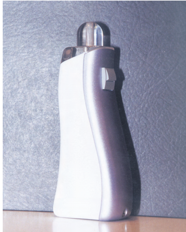
Figure 1. Hand-held, portable modified Politzer autoinsufflation device developed by the authors.

The treatment group consisted of 20 children, aged 3 to 12 years (mean: 7.8),