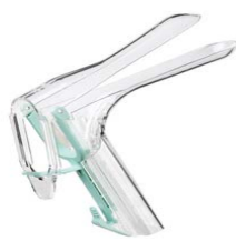
Medium 59001 CESS-90635-00