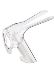
Small 59000 CESS-90634-00