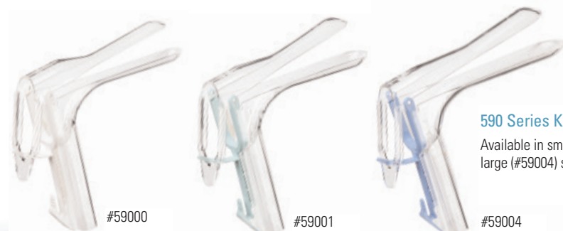
590 Series KleenSpec® Vaginal Speculum

Available in small (#59000), medium (#59001) and large (#59004) specula