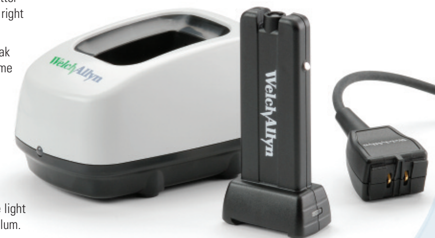
790 Series Illumination System

Shown with #79920 KleenSpec® Disposable Vaginal Specula Cordless Illuminator with Charging Station and Auxiliary Power Cord