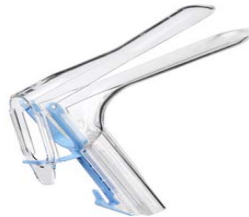
Large 59004 CESS-90636-00