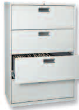
Lateral 4 Drawer