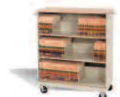
Specialty Filing & Storage