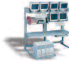
LAN & Security Systems