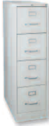
Vertical 4 Drawer