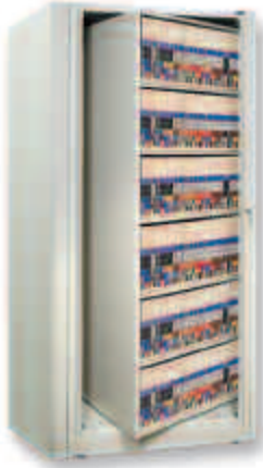
Ez2™ Rotary Action File

The Ez2™ offers up to 312%* more files per square foot than traditional filing systems!