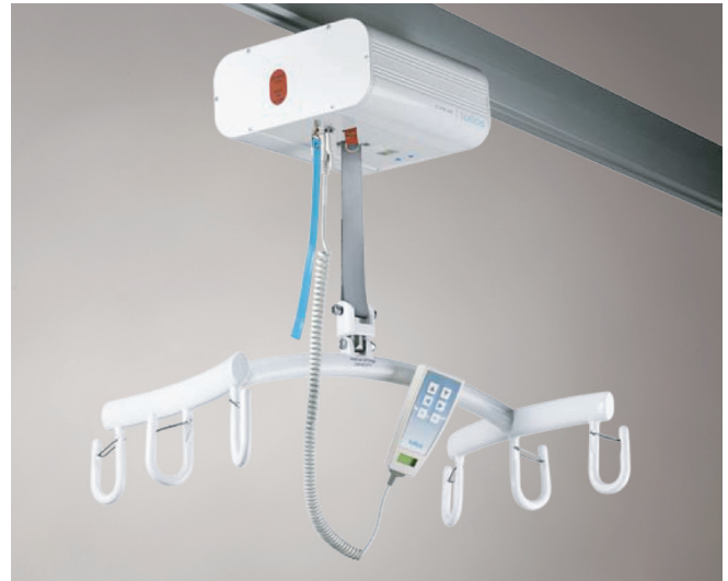
The Cirrus™ Electric Ceiling Lift combines two innovative features - an integrated patient weigh scale and iQ Technology™ - to create the smartest ceiling lift on the market.

This lift is even further enhanced by our Curtain Track Pass Through option. This solution enables you to avoid cutting privacy curtains by allowing your existing privacy curtains to work seamlessly with the ceiling lift tracks.