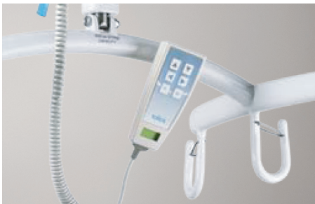
Optional wireless hand control - access all iQ Technology™ with convenient digital hand control.