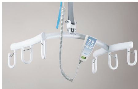
Our true six-point spreader bar, with optional locking carabiner clips, allows for maximum patient safety and can be used for effective in-bed repositioning - a task that older, two-point spreader bars just cannot effectively perform.