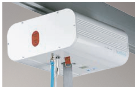
A high output lifting motor allows the Pinnacle™ to perform all lifts with one motor rather than expensive, old style dual motor systems.