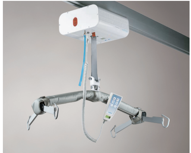
The Pinnacle™ features an industry leading lifting capacity of up to 1,000 lbs to allow for the safe transfer of even the heaviest patients, including the ever increasing bariatric population.

A long list of integrated safety features protects both caregiver and patient. The Pinnacle's™ superior selection of available sling and track configurations make it the most user-friendly, versatile ceiling lift available anywhere.