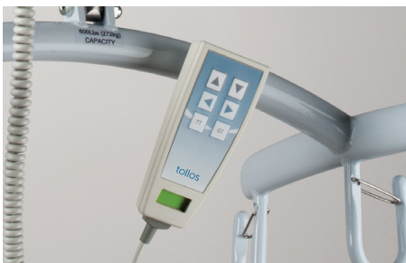
Optional wireless hand control – access all iQ Technology™ with convenient digital hand control.