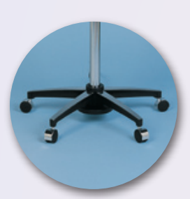
Fully Maneuverable: Warm-Lamps have a roll-around base with five swivelling casters for ease of movement, and are counterbalanced for stability & safety.